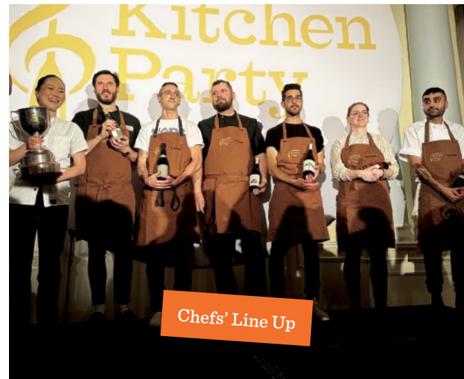
Chefs' Line Up